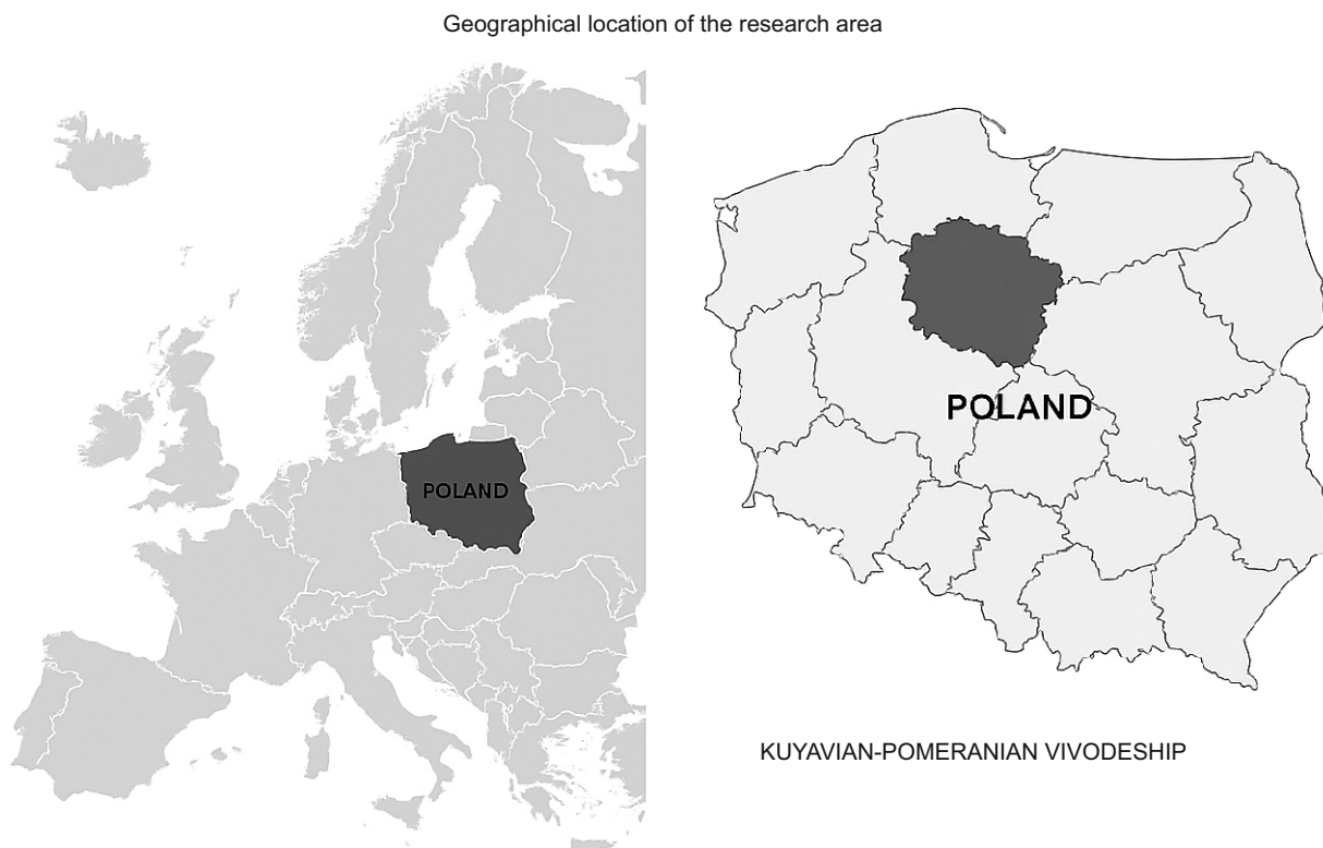
Fig. 1. Geographical location of the research area Source: own elaboration.

Consequently, despite its theoretical significance, hydropower potential is inherently more challenging to harness compared to other renewable energy technologies with broader geographic applicability. Currently, the Kuyavian-Pomeranian Voivodeship utilises approximately 57% of its theoretically available hydropower potential, as estimated by the Kuyavian-