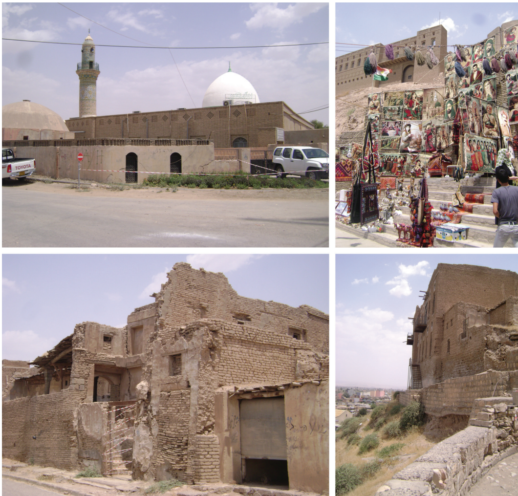
Fig. 1. Preserving heritage inside urban fabric Erbil citadel

a distinctive design from the late Ottoman period. Published historical records document the settlement antiquity corresponds to ancient Arbela, a major political and religious centre in Assyrian civilization, which is belonging to 6000 years BC ( https://whc.unesco.org ) (Fig. 1). “Erbil citadel located in the city centre. It has semi-circular form with height 30 m. Many civilizations and peoples lived on it, there are 506 houses spread in three districts: Sarai, Takya & Top khana. Its buildings are built according to a distinctive architectural style. Additionally, there is the great mosque and bathtub built in 1775 AD” (Raouf, 2010) (Fig. 1 and 3).