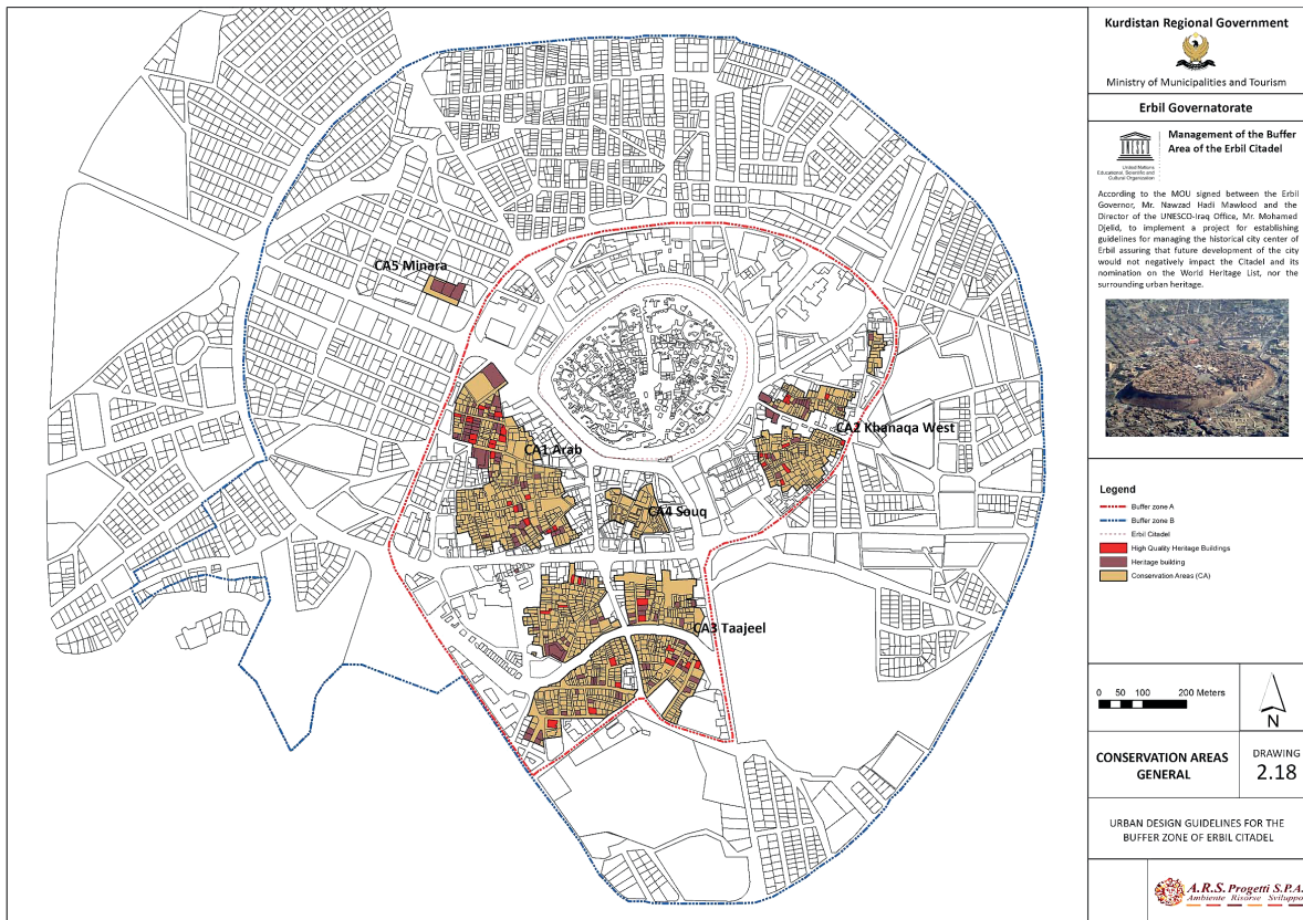
Fig. 2. Erbil city center – Conservation area general

lack of maintenance. The city centre suffers from major problems like: neglecting for maintenance especially for the old buildings, bad condition for finishes and paving, severe lack of services and infrastructures, lacks of vitality at night-time, the isolation of the citadel from the traditional fabric by the first ring road, which isolate it and give it the character of a monument more than part of the whole urban fabric of the centre, all that lead for need of new intervention to renew this urban heritage (Raouf, 2010). In the 2004, Erbil citadel choose as one of the properties inscribed on the world heritage. It is a famous archaeological location that witness dramatic transformation within the past 50 years ago. Because of the lack of interest in this location in ancient time, “Erbil municipality decided to take part in an important project to revitalize the citadel