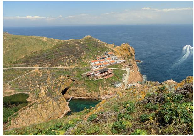
Photo 2. Berlengas Natural Reserve