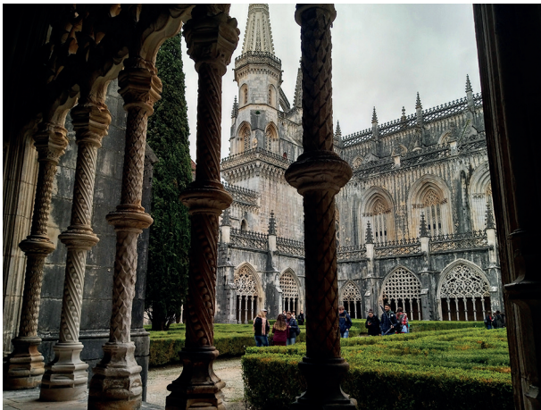
Photo 3. Monastery of Batalha