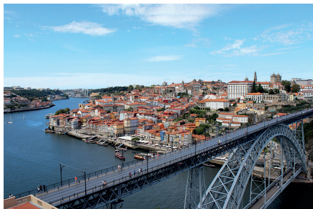
Photo 7. Historic Centre of Oporto, Luiz I Bridge and Monastery of Serra do Pilar