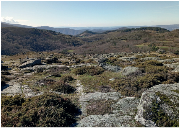
Photo 1. Alvão Natural Park