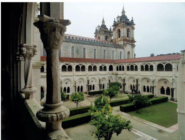
Photo 5. Monastery of Alcobaça