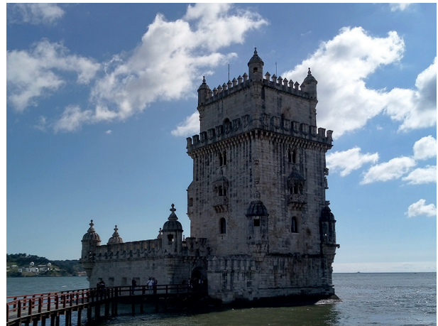
Photo 4. Monastery of the Hieronymites and Tower of Belém in Lisbon