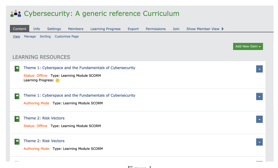
Figure 1 q.nato.int/ilias.php?ref_id=1505&cmdC

Figure 1 shows the general layout of the e-learning course.