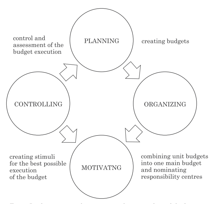
Fig. 1. Implementation of management functions through budgeting

Through budgeting, all management functions are performed (Fig. 1).