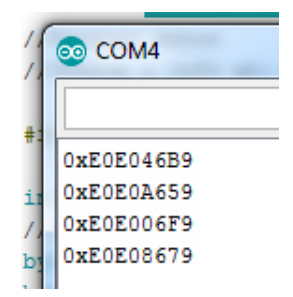
Fig. 11. Values displayed on the serial monitor

The device was connected to a computer and power supply, and the program reading the signal from the remote control was uploaded to the microcontroller. The serial monitor was turned on, and four selected keys were pressed. The displayed values (Fig. 11) were input in the appropriate lines of the code (Fig. 12).